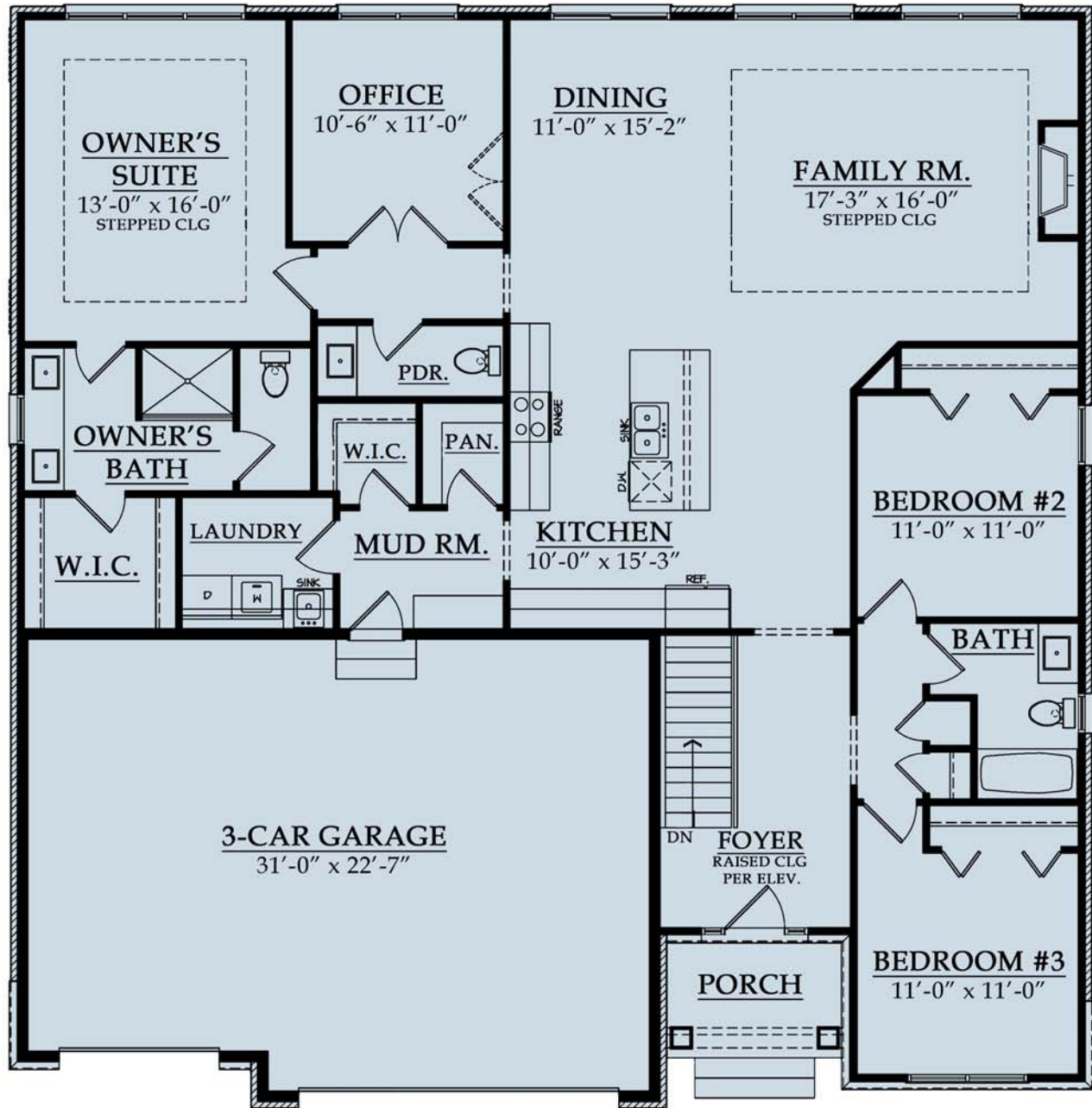
• FIRST LEVEL